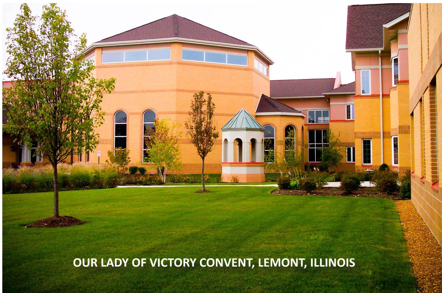
OUR LADY OF VICTORY CONVENT, LEMONT, ILLINOIS